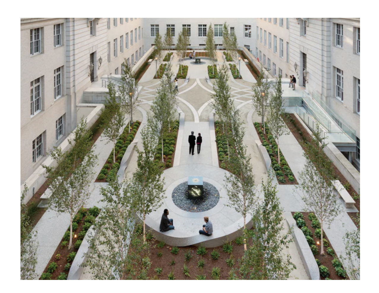
Ribbons by Cliff Garten Studio, San Francisco

Ribbons is a landscape sculpture and plaza design for the Art and Architecture Program of the General Services Administration in San Francisco. A matrix of paving, seating, fountains and planting are inserted into the existing courtyard. The design carefully straddles a line between preservation and adaptive reuse.