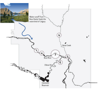
The City of Calgary

TITLE A Public Art Plan for Utility Infrastructure