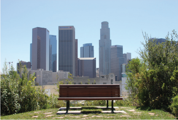
Vista Hermosa Park