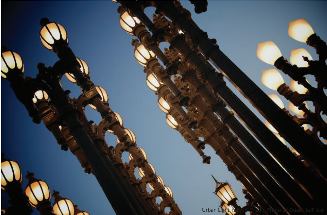
Urban Light, Nighttime