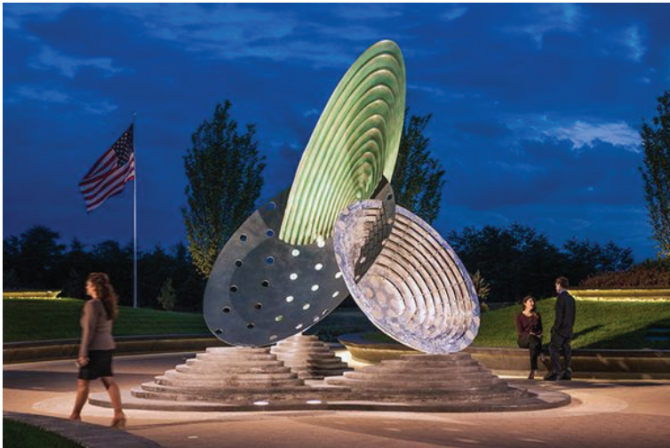
A close up of the sculpture; credit: Cliff Garten Studio

The whole area is well visible from the surrounding tall office buildings, including the adjacent National Geospatial Intelligence Agency. The employees and visitors use the space extensively – to rest, meet, and socialise. The central sculpture provides a great