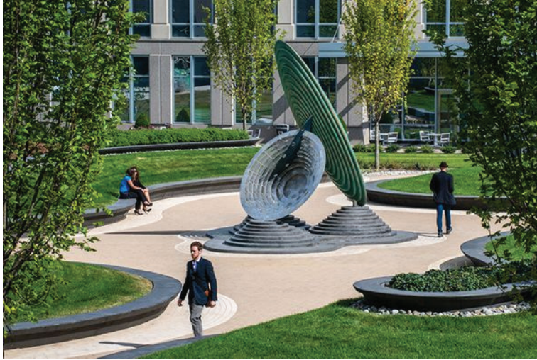
Sculpture for the Receptor project; credit: Cliff Garten Studio