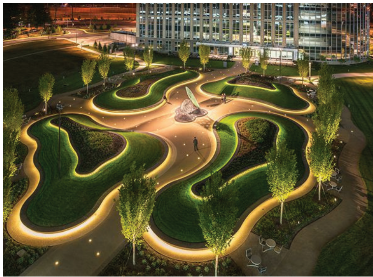
Lit up at night the Receptor project is certainly eye catching

Cliff Garten is a recipient of several rewards and fellowships, including being cited for design excellence by the American Society of Landscape Architects . His designs are defined by the fusion of sculpture and landscape architecture, integration of private and public function, personal and social experiences. The spaces designed in his studio are always site – specific, combining architecture, landscape and engineering and introducing art into people’s everyday lives.